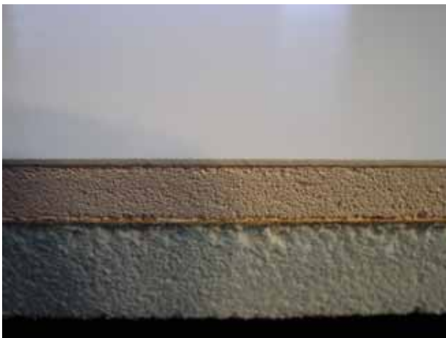
Seal A Hatch Prefabricated Panel Materials

The radiant barrier attic side cover has aluminum facings that are 97% radiant heat reflective. The prefabricated panel has an effective R-value of 13 along with a superior magnetic sealing system to virtually eliminate air leakage between the attic and home. The panel can be painted if desired, however, the smooth white surface never needs painting and can be cleaned easily with mild detergents and water.